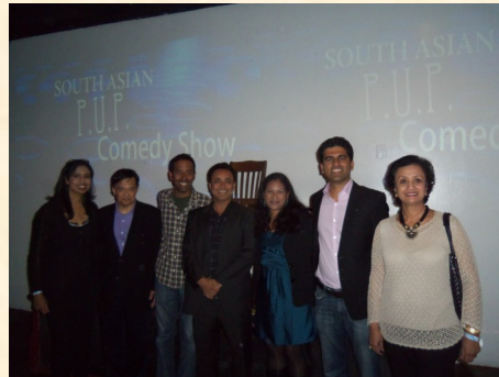
Comedy Fundraiser for IMANE Charitable Projects, June 2012