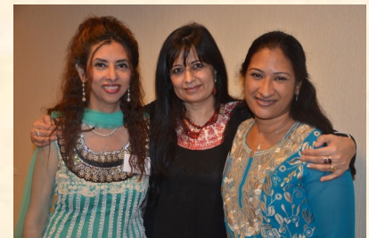
IMANE EC Members at the UIANE-IMANE Community Wellness Fair, June 2012