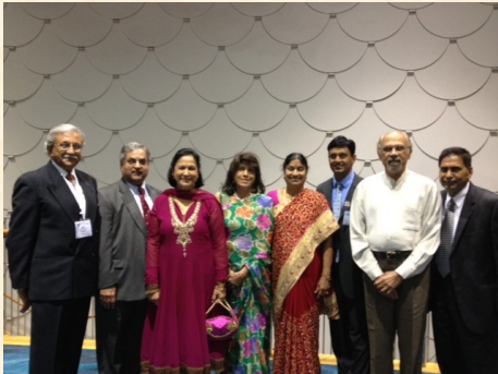
IMANE Members at 2012 AAPI Convention