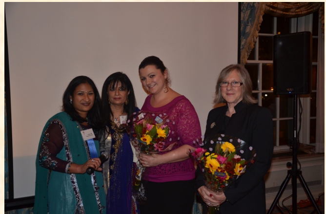
Our MMS Chapter Administrators