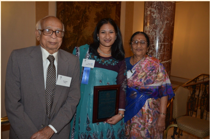
The most important mentors of all