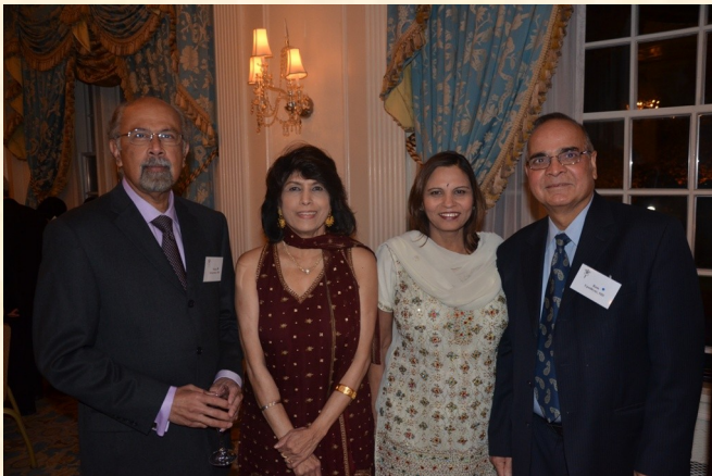
Worcester IMANE Life Members