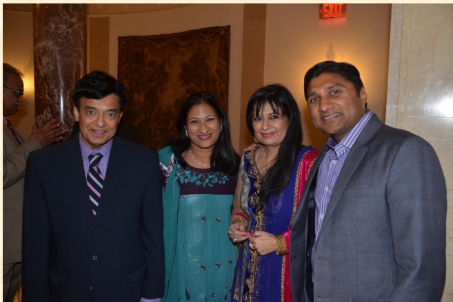
2012 and 2013 Presidents and Chairs of BOT