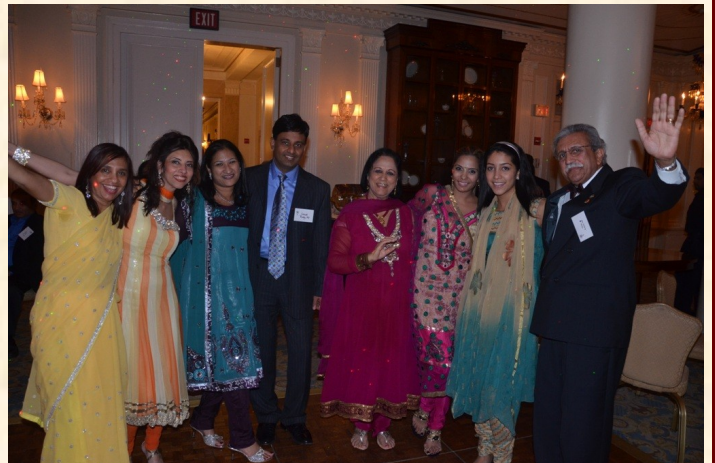
Best wishes to the 2013 Team and Happy Holidays!