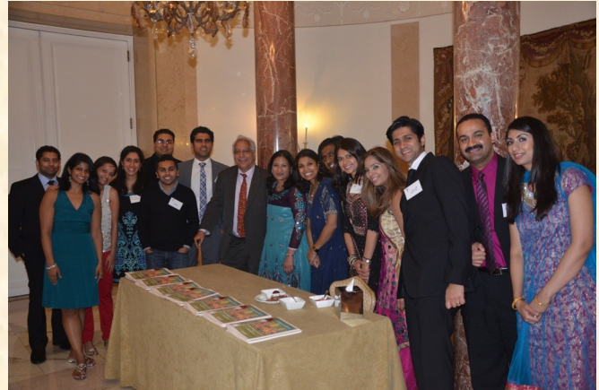
Our Young Physicians